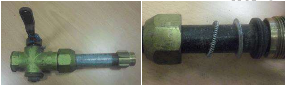
Pictures above show an example of an ECV which will require an adaptor – the ECV does not require changing if it is fully functional and not leaking.

There are many types of ECV currently in operation which are different in style to the current British Standards BS21 and BS746. One example is shown in the pictures below.