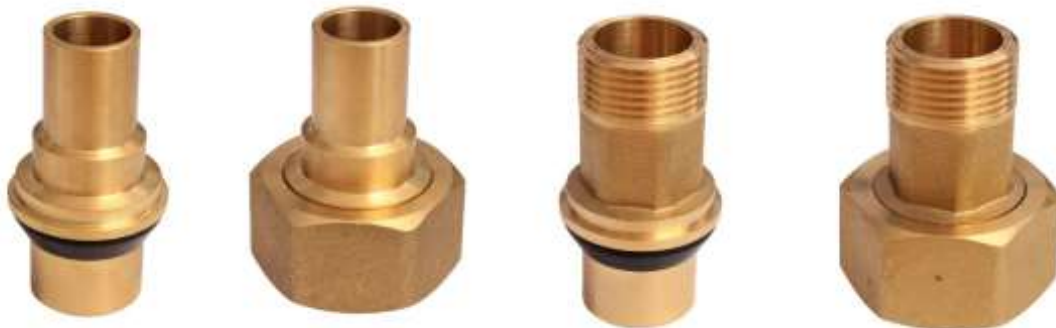
Picture above show an example of two types of ECV adaptor to allow the meter install to take place – both with a BS746 outlet thread and 22mm capillary – the ECV does not require changing if it is fully functional and not leaking.

In most instances, it will not be necessary to exchange the ECV.